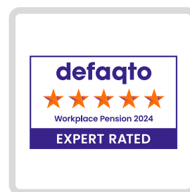
Defaqto 5 Star Rating for Workplace Pension 2024

Our bespoke system was developed and built in-house to be flexible and adaptable. We currently manage assets of more than £20 billion for over 6 million members within The People's Pension.