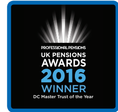
Winner of DC Master Trust of the Year 2016