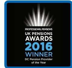
Winner of DC Pension Provider of the Year 2016