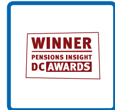
Winner of Best Governance Structure 2015