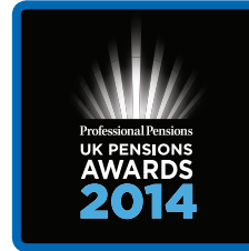
Winner of DC Provider of the Year 2014